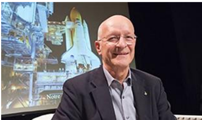
Claude Nicollier, astrophysicist and astronaut, 1 st Swiss citizen in space, participated in 4 missions with the space shuttles Atlantis, Endeavour, Columbia and Discovery.